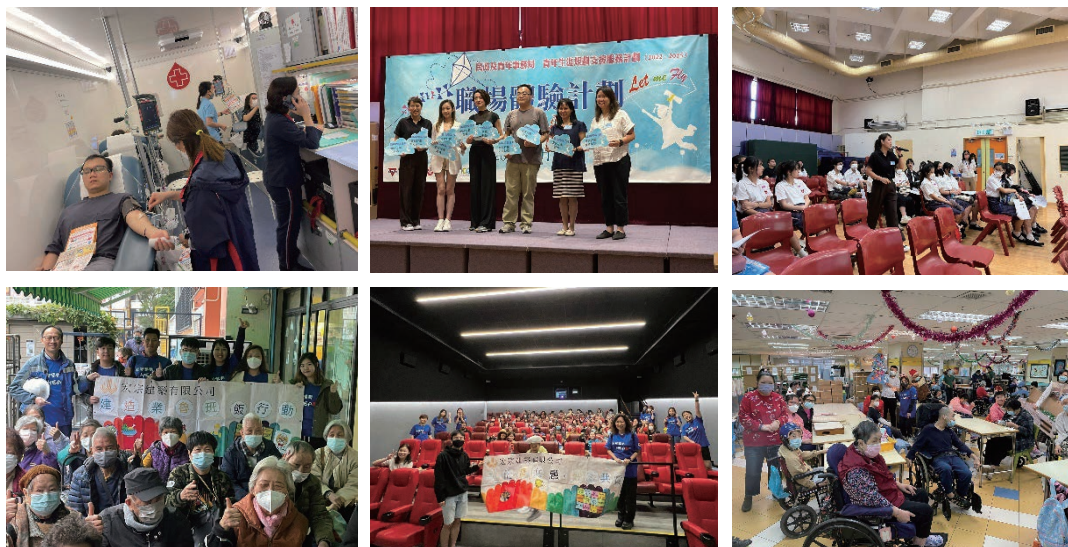
(Blood donation and volunteer activities)

The Group encourages employees to participate in community activities, such as community health initiatives, sports, cultural activities, education and volunteer work. Charitable donations made by the Group for the year ended 31 March 2024 is HK$27,448 (2023: HK$32,000).